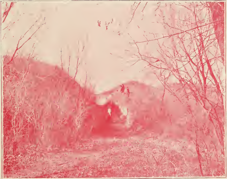
View near the Pawnee Indian Village. Road leaving the Grove at foot of the hill.